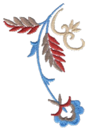
WS651_48 Western Vine Accent 2.20 X 3.44 in. 55.88 X 87.38 mm 3,939 St. S