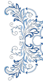
WS649_48 Western Leaf Yoke 4.94 X 9.78 in. 125.48 X 248.41 mm 22,409 St. L