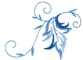
WS650_48 Western Leaf Yoke 3.15 X 2.41 in. 80.01 X 61.21 mm 2,645 St.