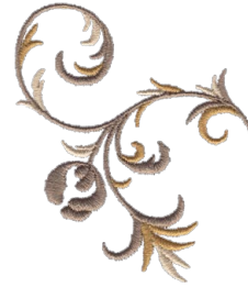
WS644_48 Western Floral Yoke 2.83 X 3.24 in. 71.88 X 82.30 mm 5,713 St.