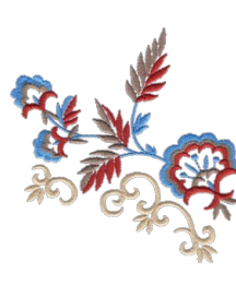
WS654_48 Western Vine Shoulder Front 4.19 X 4.32 in. 106.43 X 109.73 mm 9,860 St. S