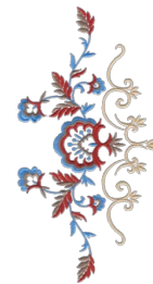
WS655_48 Western Vine Yoke 4.59 X 8.75 in. 116.59 X 222.25 mm 17,249 St. L