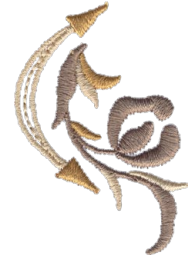
WS640_48 Western Floral Collar or Cuff 1.52 X 2.26 in. 38.61 X 57.40 mm 2,705 St. S