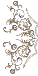
WS643_48 Western Floral Yoke 4.40 X 9.09 in. 111.76 X 230.89 mm 26,263 St. L