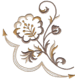
WS642_48 Western Floral Shoulder Front 3.94 X 4.17 in. 100.08 X 105.92 mm 10,280 St. S