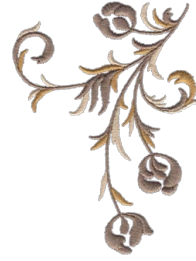
WS639_48 Western Floral Accent 3.30 X 4.40 in. 83.82 X 111.76 mm 9,901 St. S