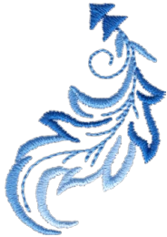
WS646_48 Western Leaf Collar or Cuff 1.62 X 2.39 in. 41.15 X 60.71 mm 2,170 St.