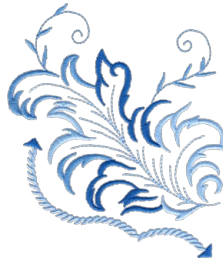
WS648_48 Western Leaf Shoulder Front 4.14 X 4.68 in. 105.16 X 118.87 mm 9,141 St.