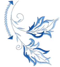
WS645_48 Western Leaf Accent 3.15 X 3.77 in. 80.01 X 95.76 mm 5,317 St.