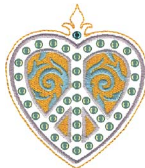
NB716_48 Glitz Heart 2 2.65 X 3.11 in. 67.31 X 78.99 mm 6,535 St. ✿