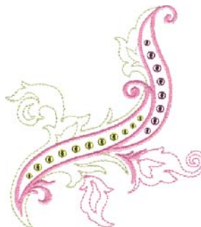
NB728_48 Glitz Swirl 3 3.84 X 4.43 in. 97.54 X 112.52 mm 4,870 St. ✨