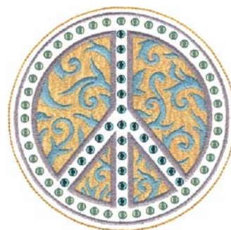
NB729_48 Large Glitz Peace Appliqué 4.81 X 4.81 in. 122.17 X 122.17 mm 13,272 St. ✨