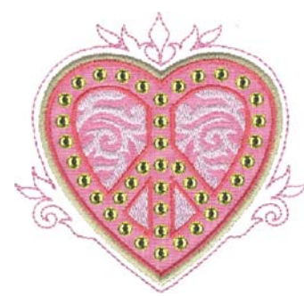
NB717_48 Glitz Heart Appliqué 3.70 X 3.59 in. 93.98 X 91.19 mm 10,825 St. ✿