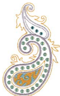
NB720_48 Glitz Paisley 2 2.95 X 4.76 in. 74.93 X 120.90 mm 6,156 St. ✿