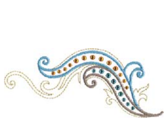
NB726_48 Glitz Swirl 1 2.11 X 5.18 in. 53.59 X 131.57 mm 4,100 St. ✨ L

Note: Some designs in this collection may have been created using unique special stitches and/or techniques. To preserve design integrity when rescaling or rotating designs in your software, always rescale or rotate designs using the handles directly on-screen.