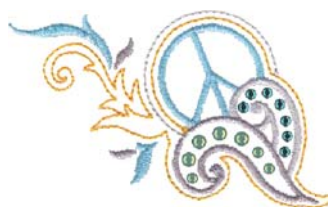
NB724_48 Glitz Peace Swirl 2 3.67 X 2.14 in. 93.22 X 54.36 mm 3,408 St. ✿