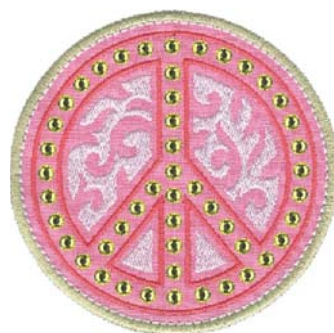
NB722_48 Glitz Peace Appliqué 3.75 X 3.74 in. 95.25 X 95.00 mm 11,451 St. ✿