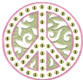
NB733_48 Small Glitz Peace 2.98 X 2.97 in. 75.69 X 75.44 mm 8,117 St. ✨

⌘ Design contains a loose fill. ⚙ Some white areas shown are not stitched.