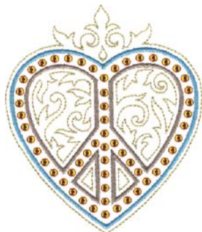
NB715_48 Glitz Heart 1 3.65 X 4.29 in. 92.71 X 108.97 mm 6,292 St. ✿