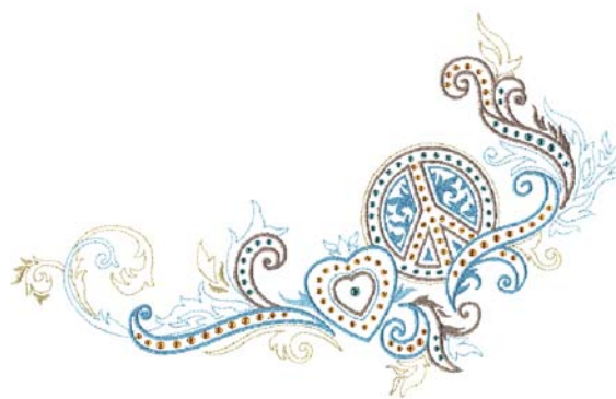
NB732_48 Peace Love & Glitz 7.77 X 12.45 in. 197.36 X 316.23 mm 23,596 St. ✨ L