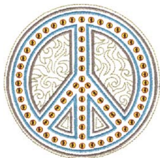
NB730_48 Large Glitz Peace 4.60 X 4.60 in. 116.84 X 116.84 mm 11,644 St. ✨