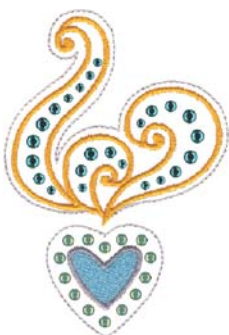
NB718_48 Glitz Hot Heart 3.01 X 4.46 in. 76.45 X 113.28 mm 4,787 St. ✿