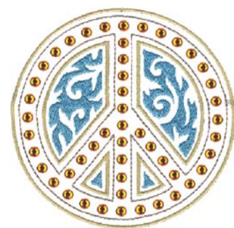
NB725_48 Glitz Peace 3.88 X 3.87 in. 98.55 X 98.30 mm 9,063 St. ✿

✿ Design contains a loose fill. ✿ Some white areas shown are not stitched.