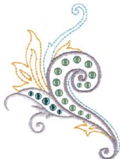
NB727_48 Glitz Swirl 2 2.75 X 3.77 in. 69.85 X 95.76 mm 3,481 St. ✨