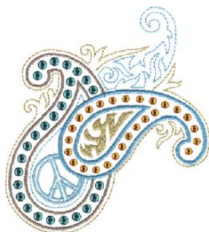
NB719_48 Glitz Paisley 1 4.14 X 4.68 in. 105.16 X 118.87 mm 8,135 St. ✿