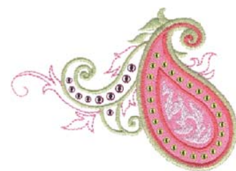
NB721_48 Glitz Paisley Appliqué 4.13 X 3.01 in. 104.90 X 76.45 mm 7,203 St. ✿