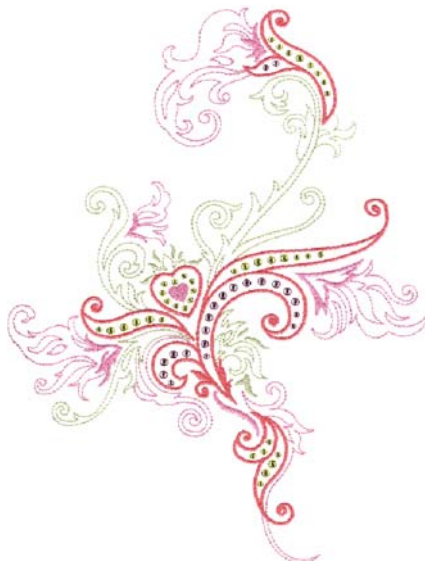
NB731_48 Love & Glitz 7.98 X 10.65 in. 202.69 X 270.51 mm 18,015 St. ✨ L