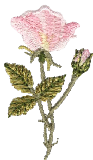
CC05801 1.12 X 2.01 in. 28.45 X 51.05 mm 2,684 St.

Note: Some designs in this collection may have been created using unique special stitches and/or techniques. To preserve design integrity when rescaling or rotating designs in your software, always rescale or rotate designs using the handles directly on-screen.