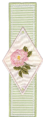
CC05810 Appliqué 2.43 X 4.96 in. 61.72 X 125.98 mm 8,796 St.