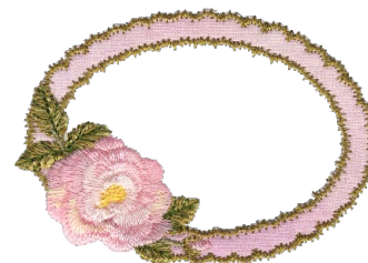
CC05808 Appliqué 3.05 X 2.19 in. 77.47 X 55.63 mm 4,955 St.