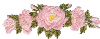
CC05806 3.56 X 1.43 in. 90.42 X 36.32 mm 8,044 St.